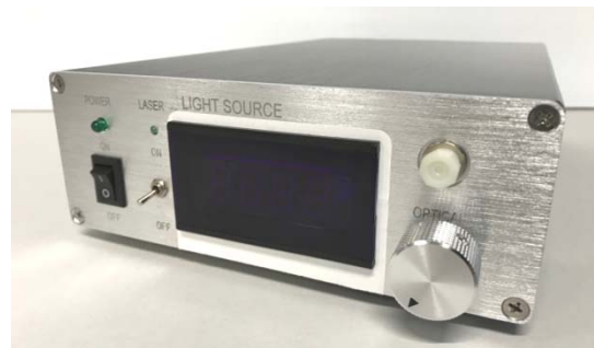
OEBSL-200A, with current display