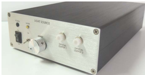
OEBSL-200, without current display