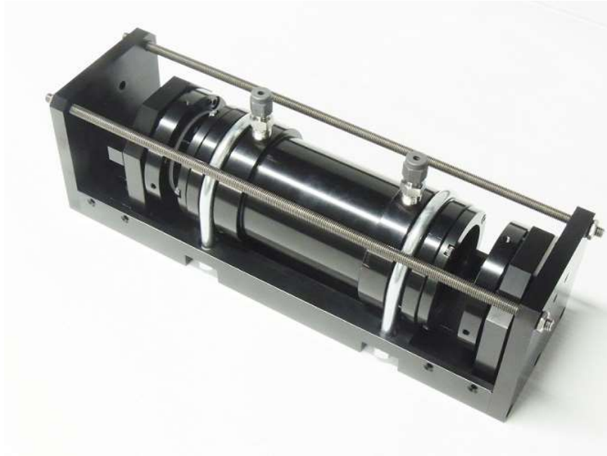
OELPC-100 Gas Cell with built-in isolated chamber